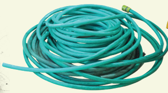
Hoses and PVC piping