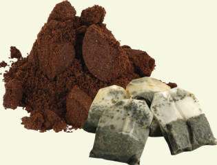
Tea bags and ground coffee