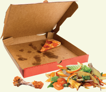
Greasy pizza boxes and food scraps