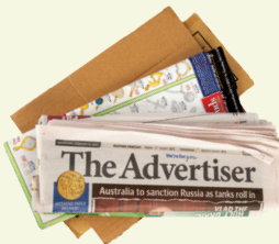
Paper and cardboard