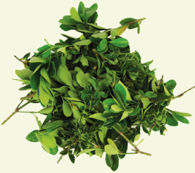
Leaves, sticks and branches