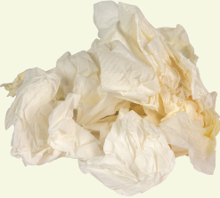
Tissues and paper towel

These items will be turned into compost to be used on farms and gardens.