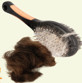
Human and pet hair