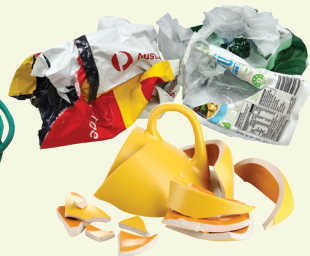
Crockery and all soft plastics

All this rubbish will be buried in a landfill.