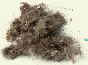
Vacuum cleaner dust