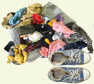
Old clothing and shoes

The red-lid bin is for dirty, broken and unrecyclable items.