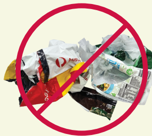
No soft plastics

Your old items will be recycled into new products to be used again.