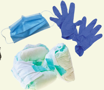
Nappies, gloves and masks