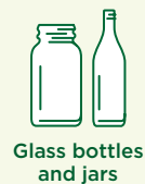
Glass bottles and jars