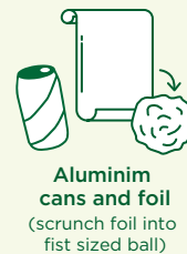
Aluminum cans and foil (scrunch foil into fist sized ball)