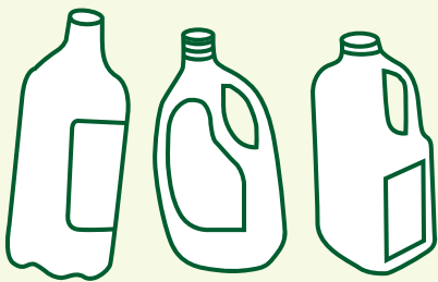
Plastic containers (lids off)