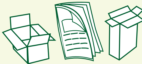
Paper and cardboard