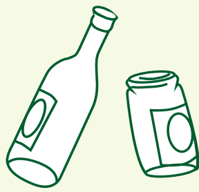
Glass bottles and jars